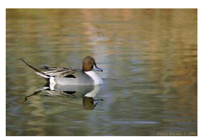
The northern pintail, one of the many species of ducks that feeds on Sago pondweed.

Sago pondweed is extremely important in the Chesapeake because it is a food source for birds. including waterfowl (especially diving ducks and swans), marsh birds, and shorebirds. The tubers and seeds are very nutritious, but leaves, stems and roots are also eaten. Sago also provides food for amphibians, reptiles, fish, and mammals. Sago beds provide